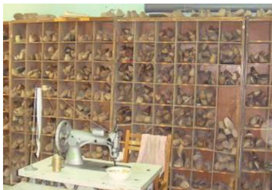
wooden mold for shoes

The center produces prosthetic limbs, gives technical guidance and provides information to people with disabilities. There are about 120 students from 16 years old to 24. They learn technology such as making prosthetic limbs, cooking and computer, depending on the level of their disabilities.