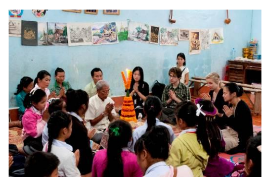
Welcome Baci Ceremony