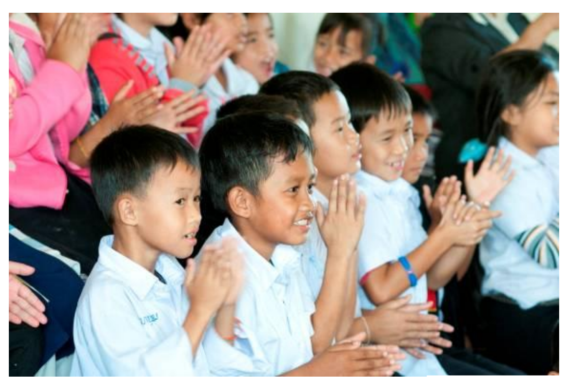
Sathit Primary School

Venues: 18 Locations Total Audience: Approximately 4,000